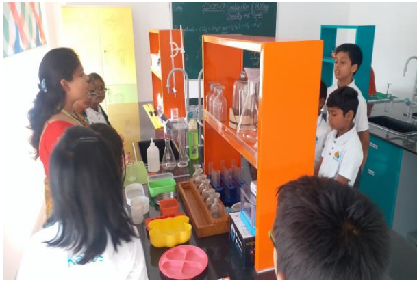
CHEMISTRY LAB PHOTO